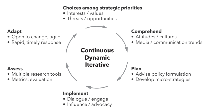
Figure 2. Adapted from Defense Science Board Task Force Report on Strategic Communication (2008), p. 12.

Say no. Strategic planning means prioritizing ruthlessly and saying no. USIA Foreign Service Officer Alan Carter once argued "the process of communication differs substantially from communication activities." Because diplomats can do just so many things well, "less is more." When diplomats string together many "different programs on different subjects for different audiences, on a sporadic and hyperactive basis," he argued, "you have nothing more than a helluva' lot of activity. But where an issue of consequence is discussed with an audience of consequence on a continuing basis (continuing does not mean daily; but it does mean occasionally) you have described process. Activity requires a lot of energy but not too much thought. Process requires a lot of thought."<sup>87</sup> Or as scholar/diplomat Susan Shirk put it recently, diplomats can spend their time "doing a little bit of this, a little bit of that, and not end up with much."<sup>88</sup> Saying no also means avoiding "drop in the bucket activities" that may be easier or fit more comfortably with a diplomat's self-identity.